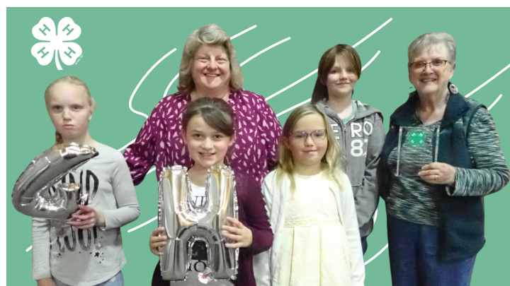
4-H Club of the Year Recipients: Hides 'N' Hares